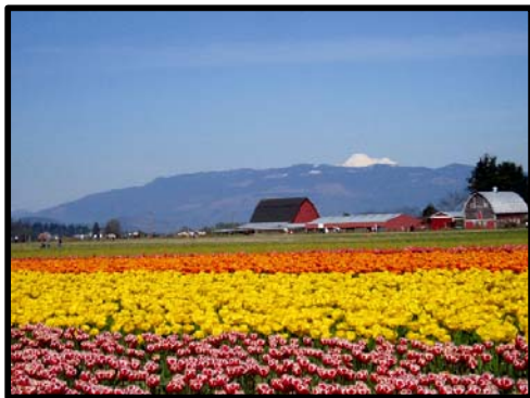
What is the value of natural capital produced by protected farm and natural lands as those of Washington's bucolic Skagit Valley? How can ecological economics help decision-makers balance environmental protection with the pressure of economic and social change?

These may be odd questions to some, but others may argue they are priceless and intangible. However, when setting environmental policies and making tough decisions about use and management of natural resources, some rational way of pricing the priceless is needed. Funding land conservation, watershed restoration, species protection, smart growth, renewable energy initiatives, and other environmental-based policy efforts is expensive.