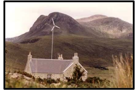
To develop policies that promote renewable energy markets in Scotland, Resource Dimensions is using ecological economics to help quantify how the public values benefits and costs of different employment and environmental impacts associated with renewable energy projects and their willingness-to-pay for "green energy".