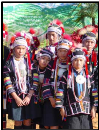
Resource Dimensions worked with international partners to integrate ecological economics into an assessment of impacts from tourism on Hill Tribes in Northern Thailand to help set policies that encourage an eco-friendly tourism industry to sustain the region's economy, environment, and its people.